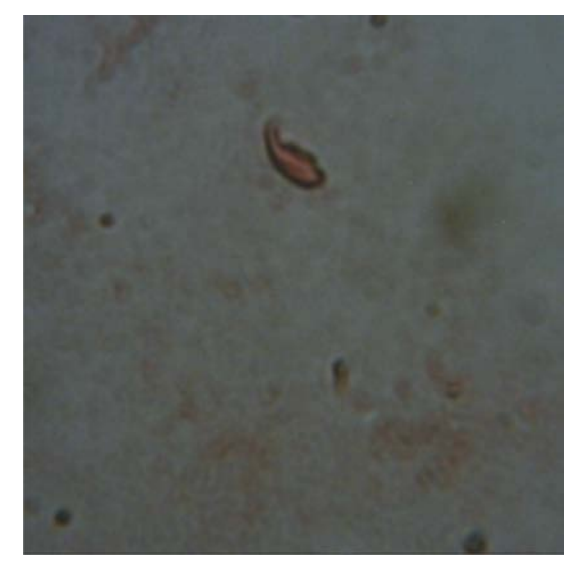
Figure 1: sperm cell without tail- as seen in groups 5 and 7

The types of abnormalities seen in the cauda epididymidal sperm of some of the experimental animals are clustered sperm cell, sperm cell with no tail and or head, and twisted tail sperm cell (figure 1 - 4). Sperm cells with no head was seen in groups 4 and 7 as shown in figure 4. In groups 5 and 7, abnormalities observed are tailless sperm cell (figure 1) and sperm cell with twisted tail (figure 2) while some sperm cell in group 4 were clustered as shown in figure 3.