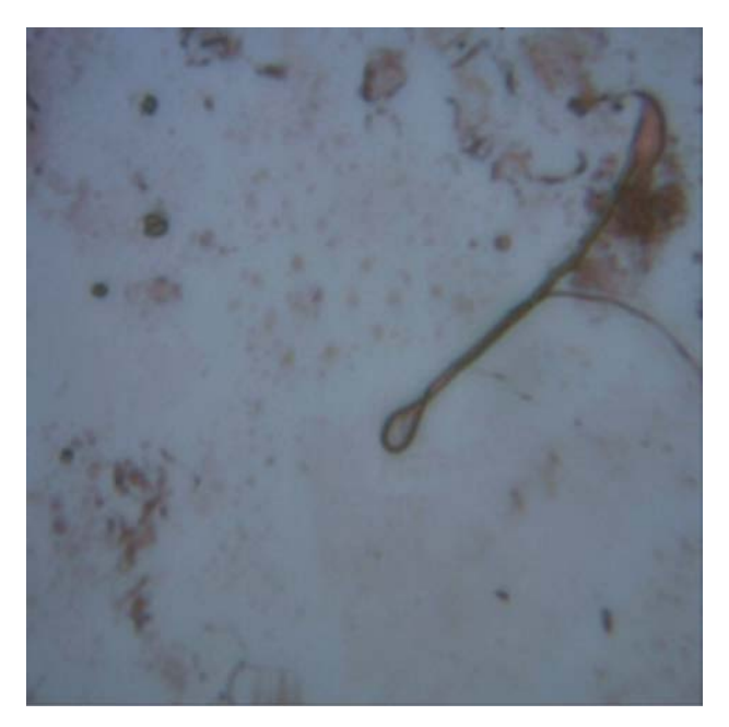
Figure 2 : sperm cell with twisted tail- as seen in groups 5 and 7