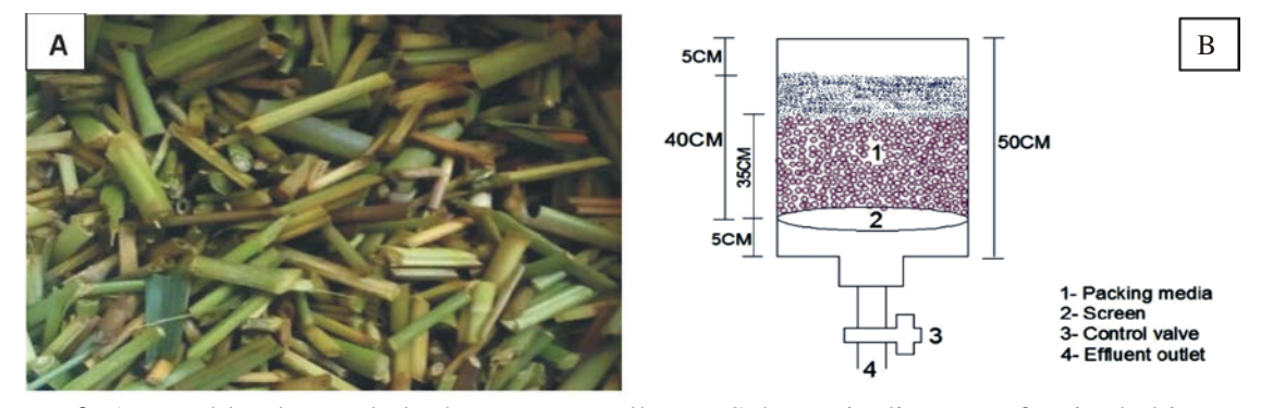
Figure 2. A: Freshly chopped elephant grass stalks; B: Schematic diagram of a single bioreactor.