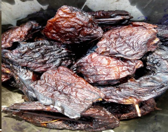
Figure 3: Smoke-dried Aba knife fish