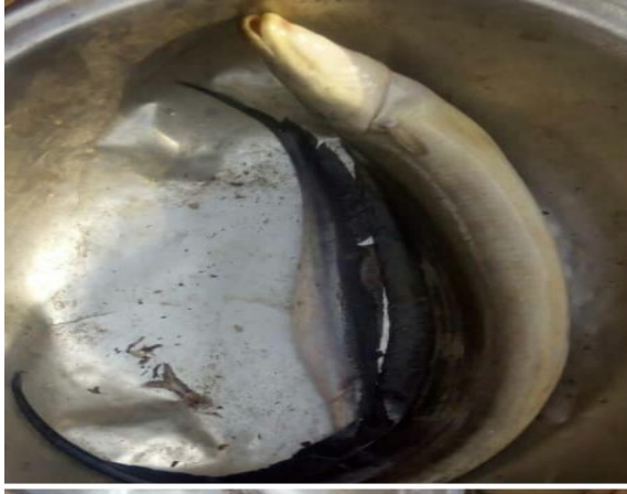
Figure 2: Fresh Aba knife fish