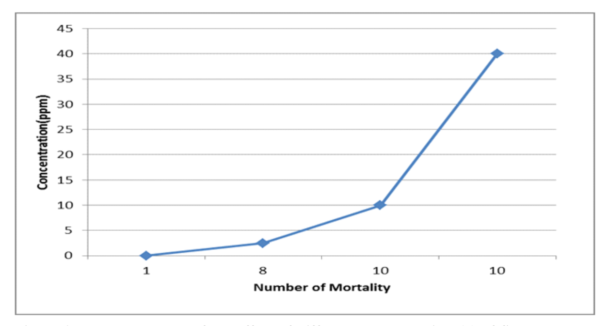
Figure 2. The scatter plot of the effect of different concentrations(y) of SMB on the mortality(x) of chicken embryo.

suggest that there is a direct proportionality between SMB and chick mortality, that is, an increase in concentration causes an increase in mortality.